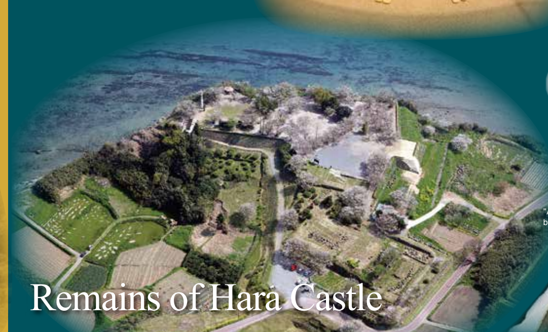
Remains of Hara Castle