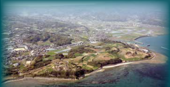
Remains of Hara Castle

“Hidden Christian Sites in the Nagasaki Region” bears unique testimony to the traditions of Hidden Christians who secretly retained their faith in Christianity while surviving alongside conventional society and its religions, such as Buddhism and Shintoism, in the absence of missionaries due to the ban on Christianity. The twelve component sites, including the Remains of Hara Castle, are located in six cities and two towns in Nagasaki Prefecture and Kumamoto Prefecture.