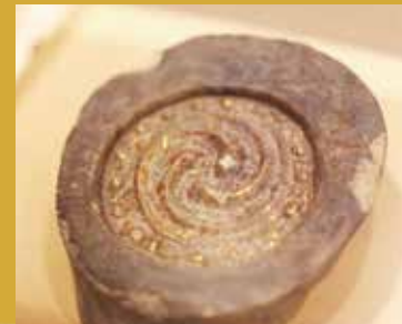
Gilded roof tile