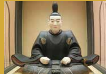
Wooden statue of Arima Harunobu