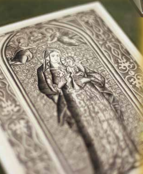
Copperplate print “Our Lady of Seville”