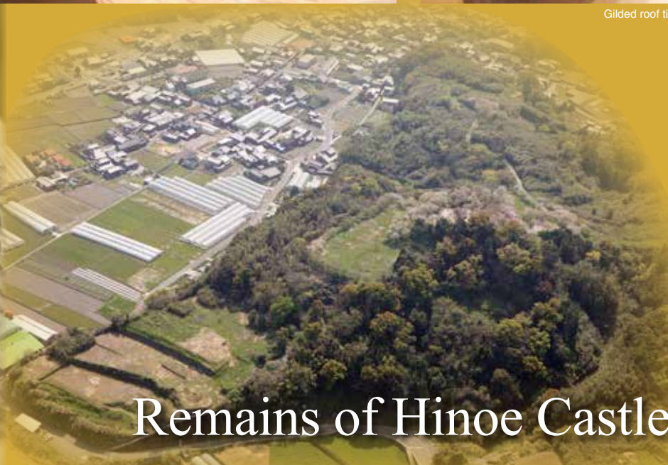
Remains of Hinoe Castle