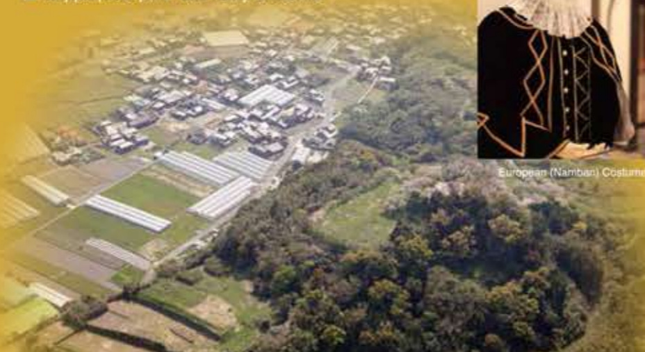
Remains of Hinoe Castle