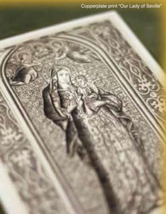
Copperplate print "Our Lady of Seville"