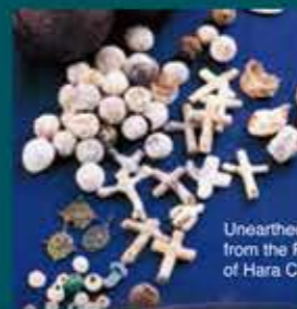
Unearthed Artifacts from the Remains of Hara Castle