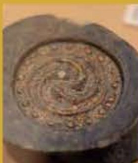
Gilded roof tile