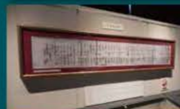
The Kuchinotsu Jointly Sealed Covenant