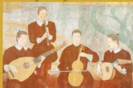
The Tensho Embassy by Hasegawa Roku (Gallery Namban's Collection)