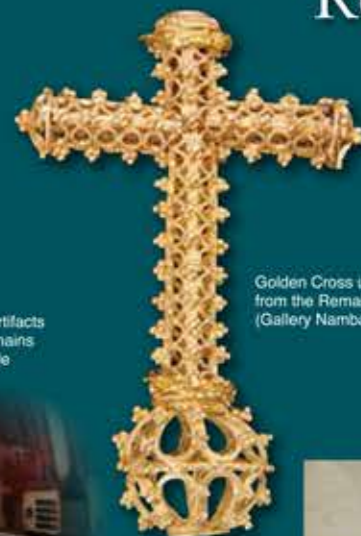
Golden Cross unearthed from the Remains of Hara Castle (Gallery Namban's Collection)