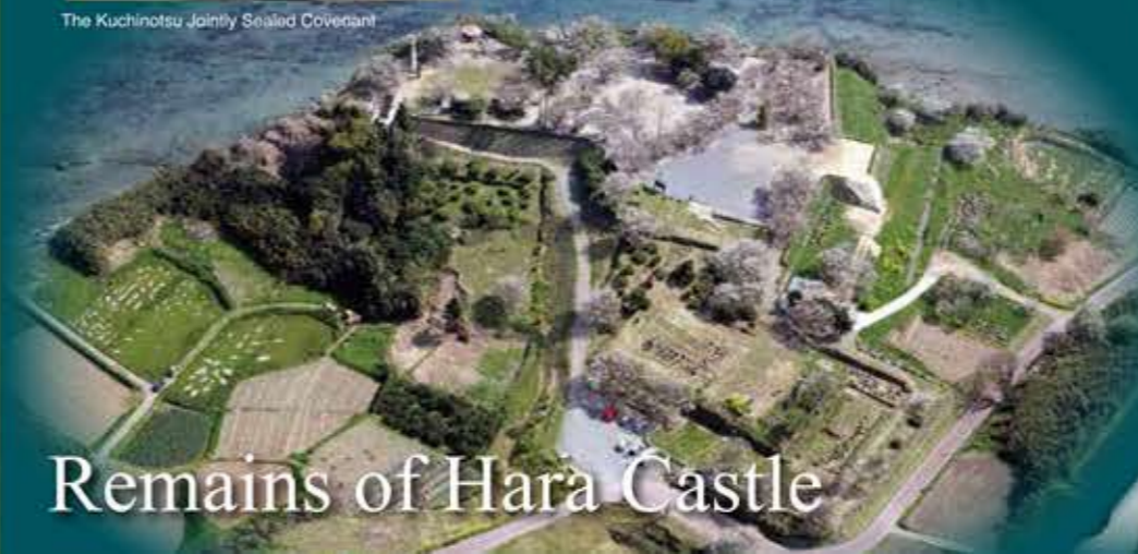
Remains of Hara Castle