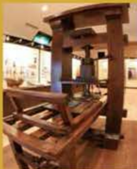
Letterpress Printing Machine