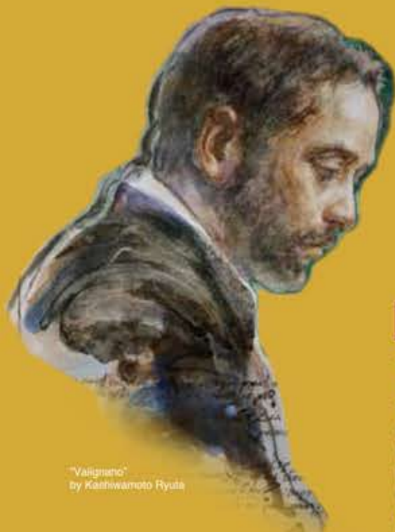
"Valignano" by Kashiwamoto Ryuta