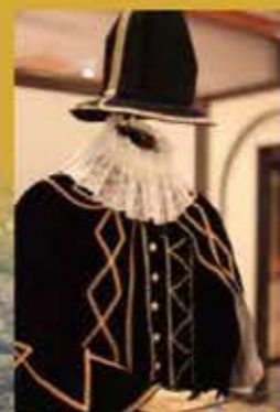
European (Namban) Costume